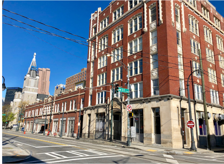
The Oddfellows Building, Atlanta

A historic preservation easement, also called a preservation covenant, is a voluntary legal agreement that can be used to protect the historical, architectural, archaeological, or cultural aspects of historic properties, either permanently or for a number of years. 37 A preservation easement typically prohibits the property owner from demolishing or making alterations that would be inconsistent with the historic character of the property and often requires advanced approval of the easement holder before certain alterations are made. An easement, depending on how it is structured, can also protect against deterioration of the structure by imposing maintenance obligations.