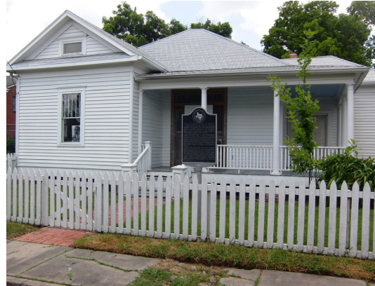
BY RUTHERFORD B. H. YATES MUSEUM Rutherford B. H. Yates House, Houston

Examples: Local historic landmark sites with ties to African American heritage include: Rutherford B. H. Yates House in Houston, Juanita Craft House in Dallas, Connelly-Yerwood House in Austin, Old African American Baptist Church in San Marcos, and Mt. Olive Missionary Baptist Church in Galveston.