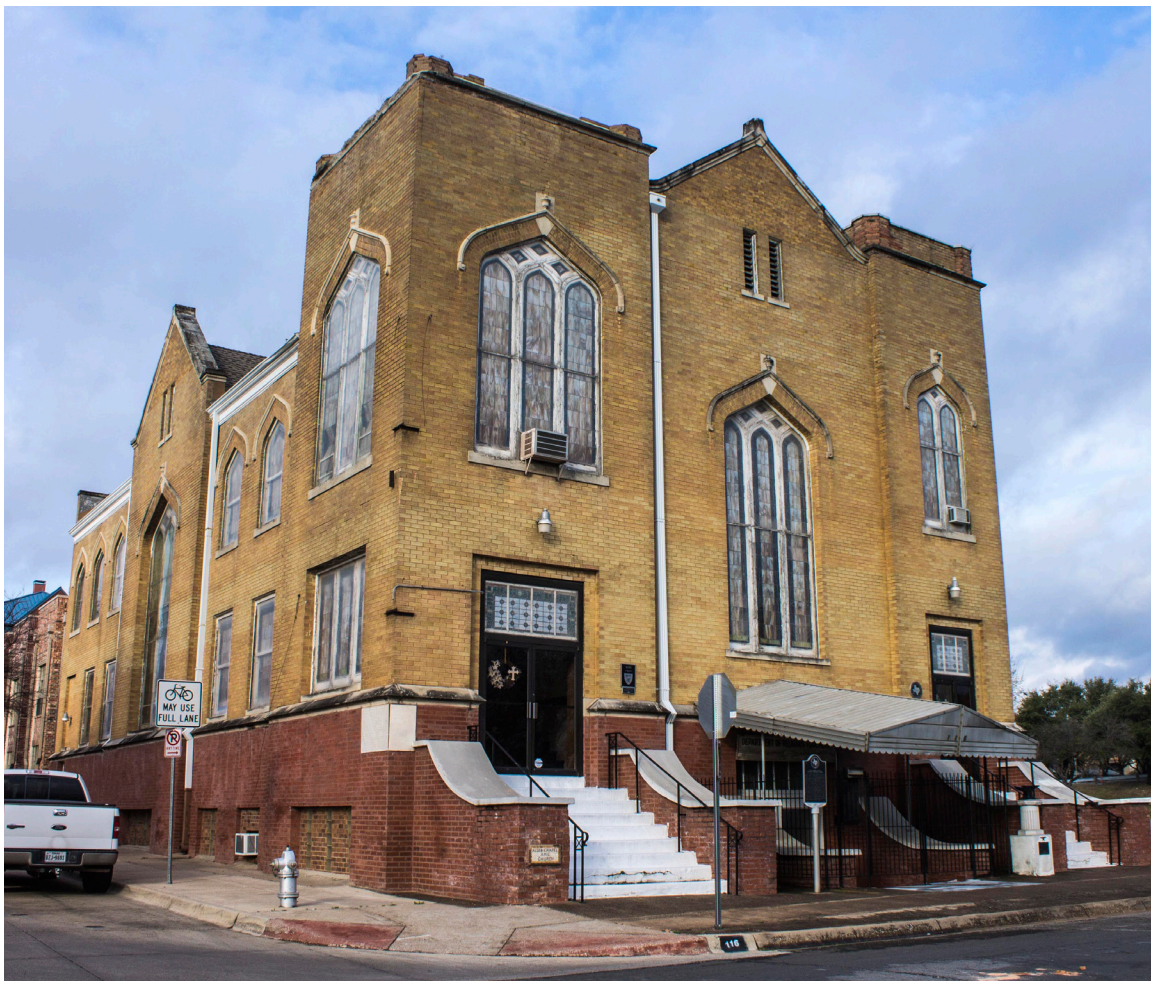
Allen Chapel AME Church in Fort Worth, TX

An electronic copy of this toolkit is available at law.utexas.edu/clinics/ecdc/publications/#historic . We welcome suggestions for updates to the toolkit! Contact us at ecdc@law.utexas.edu .