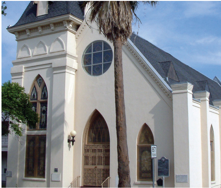
Reedy Chapel AME Church, Galveston

Listing a property on the National Register is primarily educational in nature — the listing does not restrict owners from demolishing or altering their property. However, if federal money or a federal permitting process is involved in a project impacting a property listed on the National Register, Section 106 of the National Historic Preservation Act of 1966 and other statutory protections may be triggered, which can lead to restrictions on demolitions or other changes to the property. The federal agency involved in the project impacting the historic site must also report to the Advisory Council on Historic Preservation, which then weighs in on whether the federal action will have an adverse effect on the historic site. A national register listing also opens up opportunities for heritage tourism, technical assistance with preservation, and federal and private preservation grants, and may qualify the property for federal historic preservation tax incentives (discussed further below).